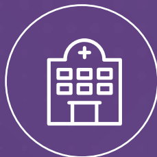
Unani colleges & hospitals