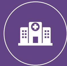
Medical, Dental & Paramedical colleges