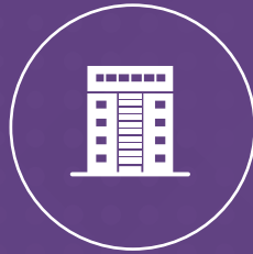
Single, Multi, Super-speciality hospitals